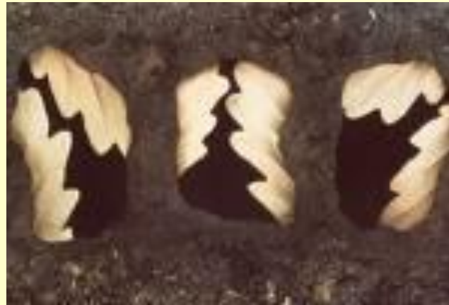
Three stones wrapped in autumn oak leaves