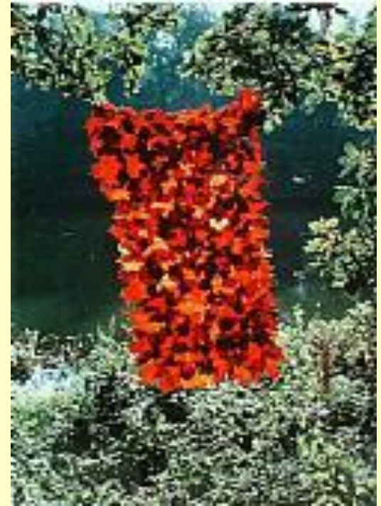
Sycamore leaves stitched together