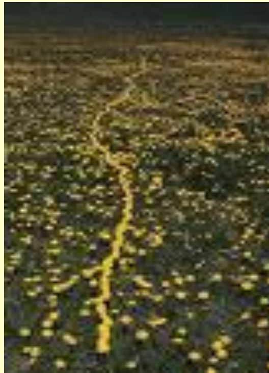
Dandelion flowers in a line through the grass