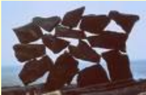
Boulder rocks placed on angles so that the light shines through the gaps