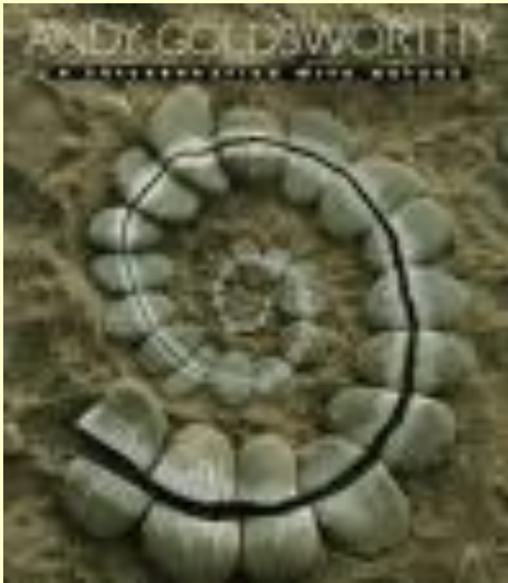
Broken pebbles in a swirl