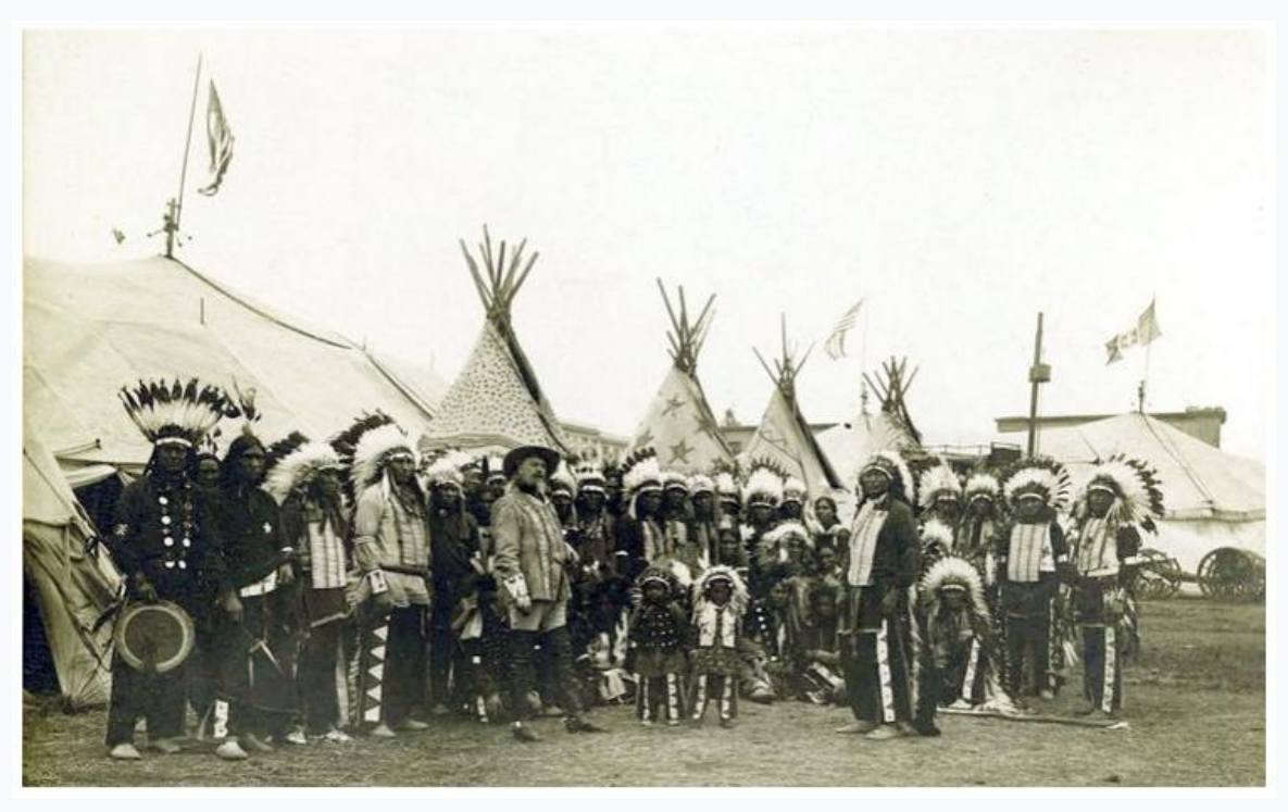
Buffalo Bill's Wild West, 1890