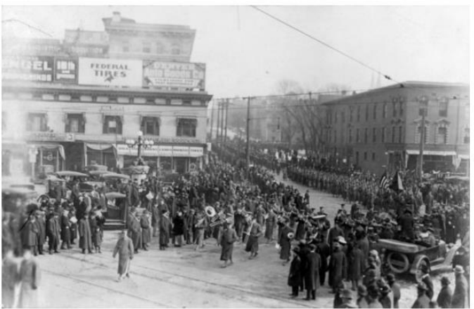
Cody's funeral procession in Denver