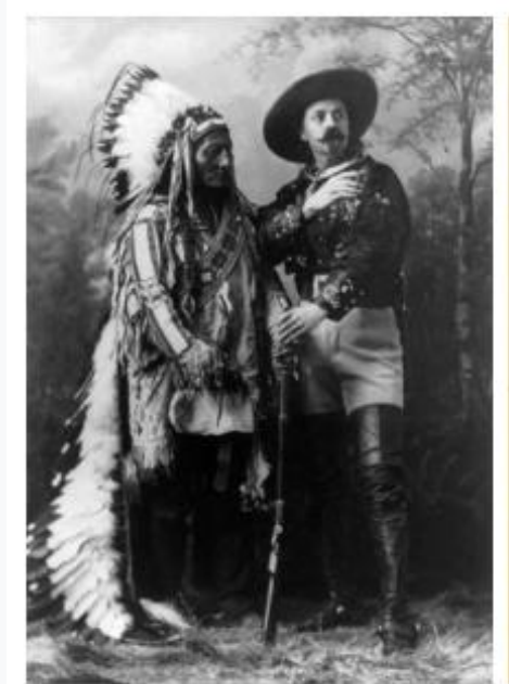
Sitting Bull and Buffalo Bill, Montreal, Quebec, 1885