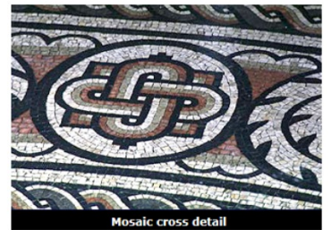
Mosaic cross detail