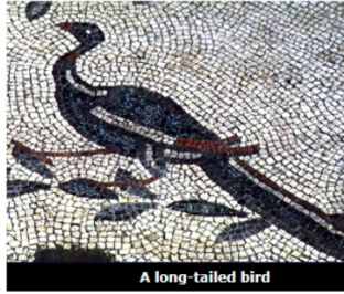
A long-tailed bird